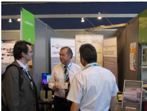
+Composites at JEC Europe 2012 – Paris March 2012

End of March 2012 +Composites was present on JEC Europe 2012 in Paris. During 3 days the team has welcome visitors on the booth and answer the interest of many European industrials.